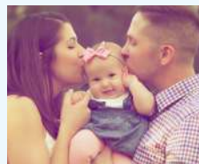
Improved Family Self-sufficiency