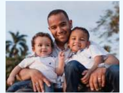
Improved Parenting Practices