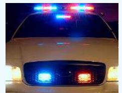
Reduced Crime and Domestic Violence