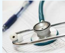
Early Detection of Health Issues and Developmental Delays