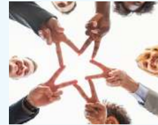
Improved Coordination and Referral for Other Community Services