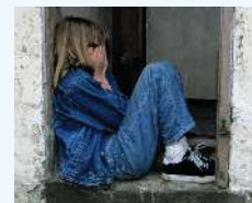
Reduced Child Abuse and Neglect