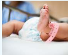
Improved Birth Outcomes

Research has proven the benefits of home visiting, including: