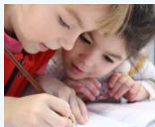
Improved Kindergarten Readiness